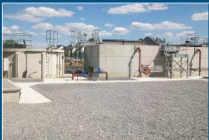
New WWTP at Kinlough

After public tender Response Group was awarded the 10.5 million euro DBO Contract for wastewater collection and treatment facilities for towns and villages in County Leitrim including Dromahaire, Drumkeeran, Kinlough, Kiltyclogher, Rooskey, Cloone, Jamestown, Ballinglera, Killarga and Dromcong. Design P.E.'s range from 100 to 2,600. The contract includes for the installation of seven new pumping stations and five refurbished pumping stations and the construction of new outfalls.