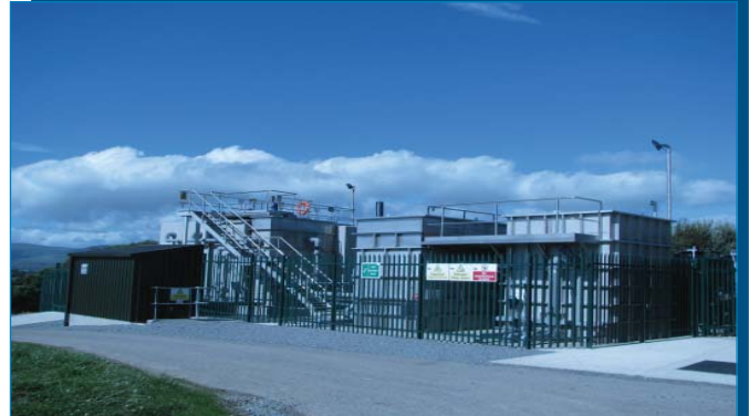
Water treatment facility at Bantry

June 2010 saw the successful completion and commissioning of the contract to design & build a water treatment facility at Bantry by Response Engineering. The civil element of this contract was completed by Response Civil. The plant is designed for a throughput of 60m 3 /hr.