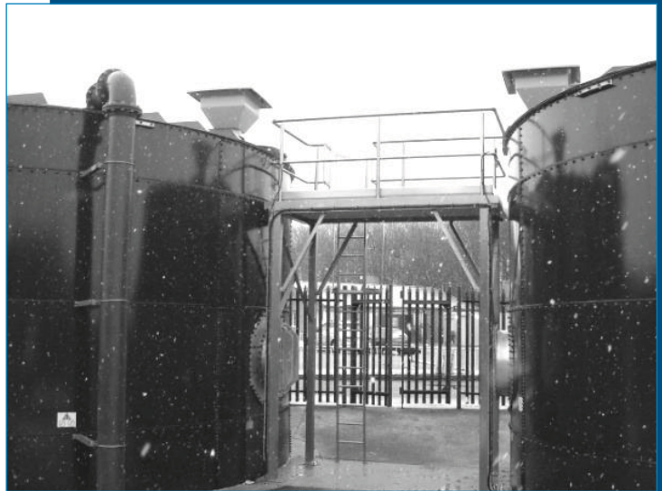
Treatment Works at High Heavens, Bucks, UK