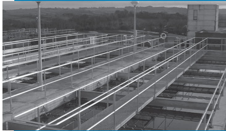
Settlement Tanks at Adamstown

Response have completed the work under several separate conventional (MF1) contracts. Treatment works upgrade included the installation of new sedimentation, filtration and sludge treatment facilities. Raw water and treated water pumping facilities were installed under separate contracts. The uprated WTW has a throughput of 58.5 M3/Day and the capital cost of the M&E work was 4.4 million euros.