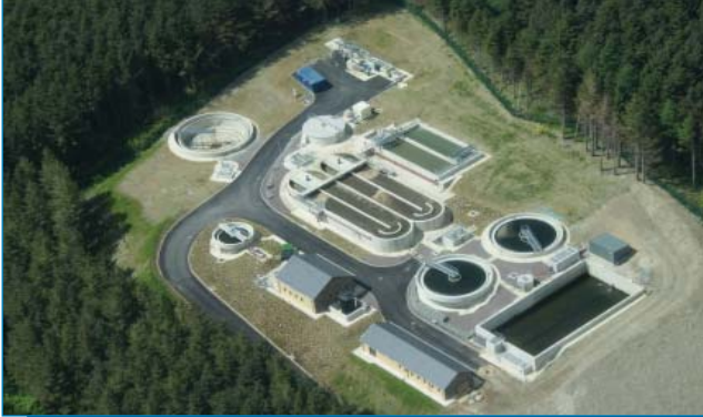
Aerial View of WWTP at Bantry

Response Engineering has completed a contract to install all mechanical and electrical plant associated with Cork County Council's new wastewater treatment works at Bantry. The works which were installed under conventional contract (MF1) provide treatment for a P.E. of 6,000.