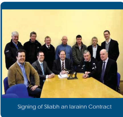
Signing of Slaibh an Iarainn Contract