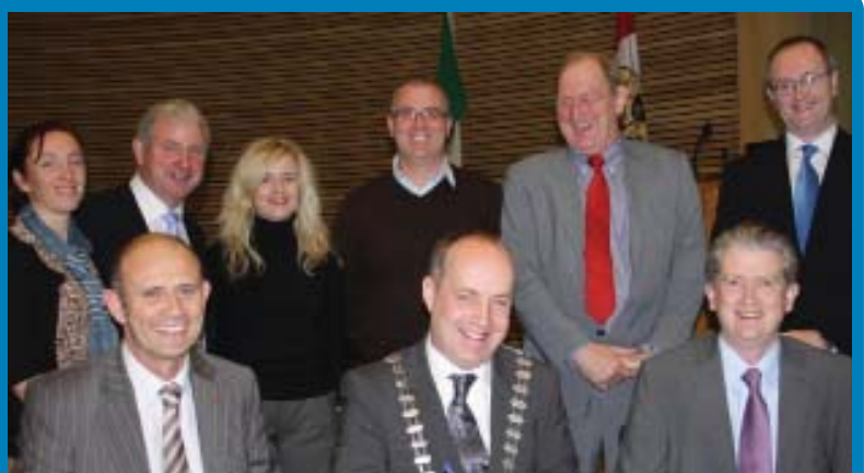
Signing of Little Island Civil Contract

As part of the contract the existing storm water collection system in the GB Business Park and Sitecast Industrial Estate will be upgraded and stormwater drainage will be provided for a section of the Clash Road. Site works commenced in January with an anticipated construction period of 7 months.