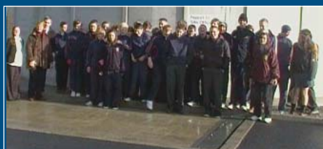
Students of Our Lady's Secondary School at Templemore WWTP