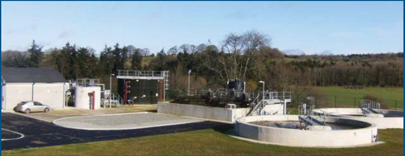
Bunclody WWTP Site Layout

Response Engineering has recently completed the construction of a 6,500 PE Wastewater Treatment Facility for Wexford County Council at Bunclody. The works were procured as a 20 yr DBO Contract and the scope included all civil, mechanical and electrical works for Main Lift Pumping, Storm Retention, Inlet Screening/Grit Removal, Aeration, Clarification, Sludge Handling/Dewatering and SCADA Systems.