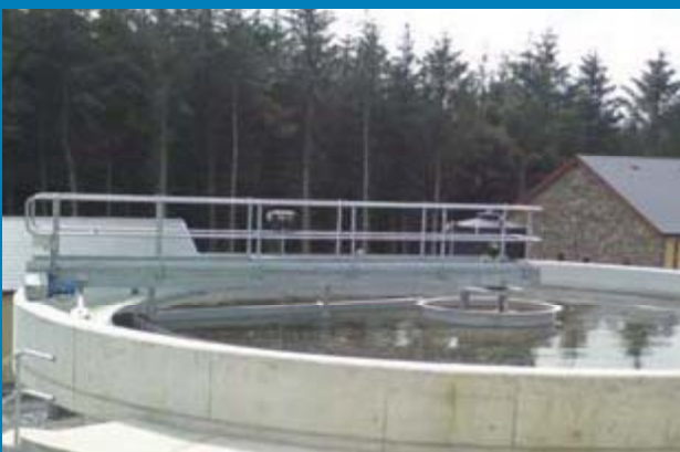
Half Bridge Scraper System

Response Engineering have recently launched their new Product Sales Division which will focus on delivering products to the marketplace, particularly in the UK. Response Engineering can offer a wide range of water and wastewater treatment specific products to the market, built to your specifications. These products have been widely installed and are operational on plants throughout Ireland and the UK. Products offered include Half Bridge Scrapers, Picket Fence Thickeners, Grit Traps, RBI's, Penstocks, Aerator Wheels, Inlet Works, DAF Plants, Lamallae plates and Tube Settlers. A full set of brochures can be found at www.response-group.ie . for further details call Response Engineering Head Office at +353 63 33400.